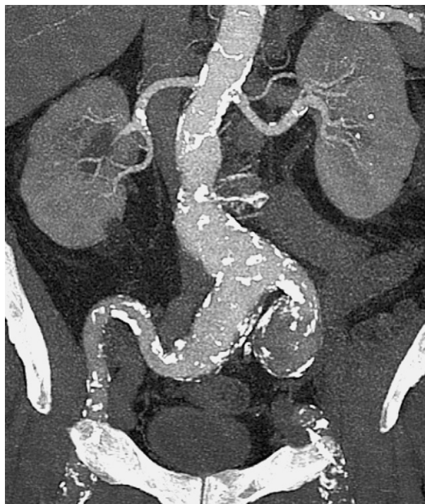
Fig. 1. Coronal reconstruction of the preoperative computed tomography scan, showing a bilateral iliac aneurysm. The high diameter of the distal common iliac arteries prevents landing of an endograft.

been described, such as bowel 13 and skin 14,15 necrosis.